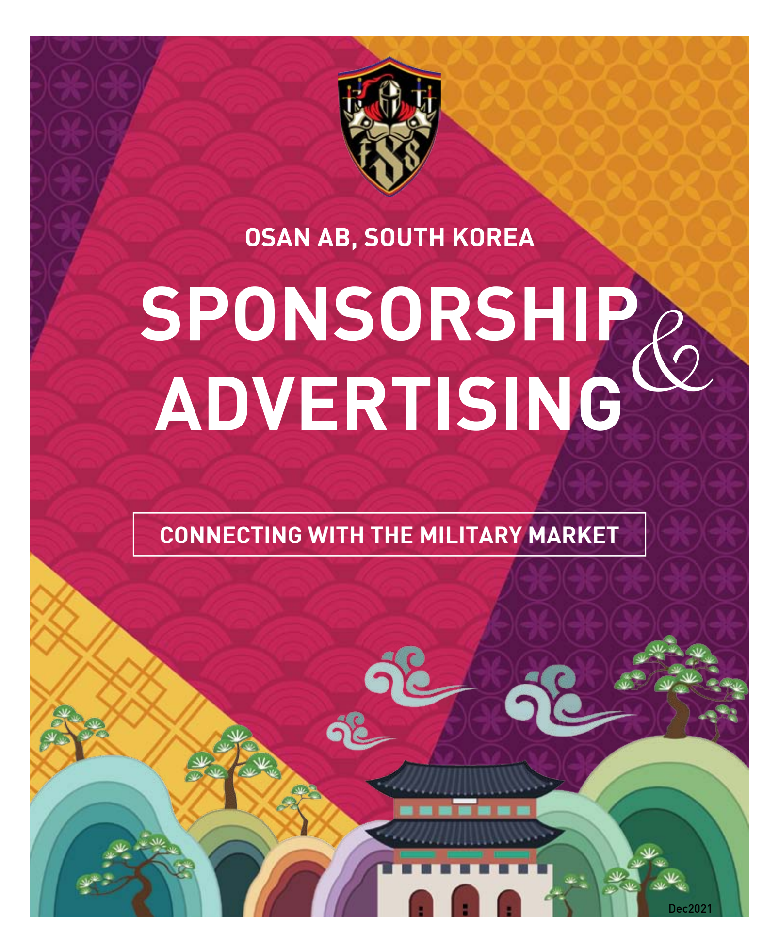
51st Force Support Squadron